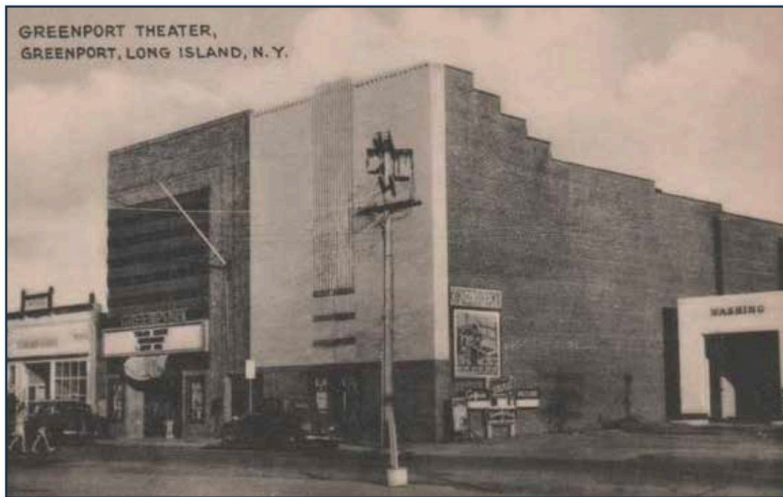
Postcard of Greenport Theater, 1938.