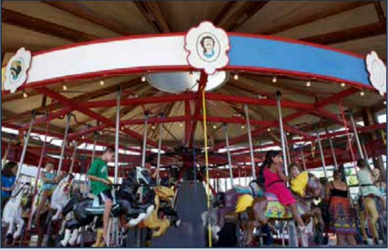
For the kids: antique carousel at Mitchell Park. There's something for everyone in a truly charming place to live.

At the end of the summer is the Annual Maritime Festival; this